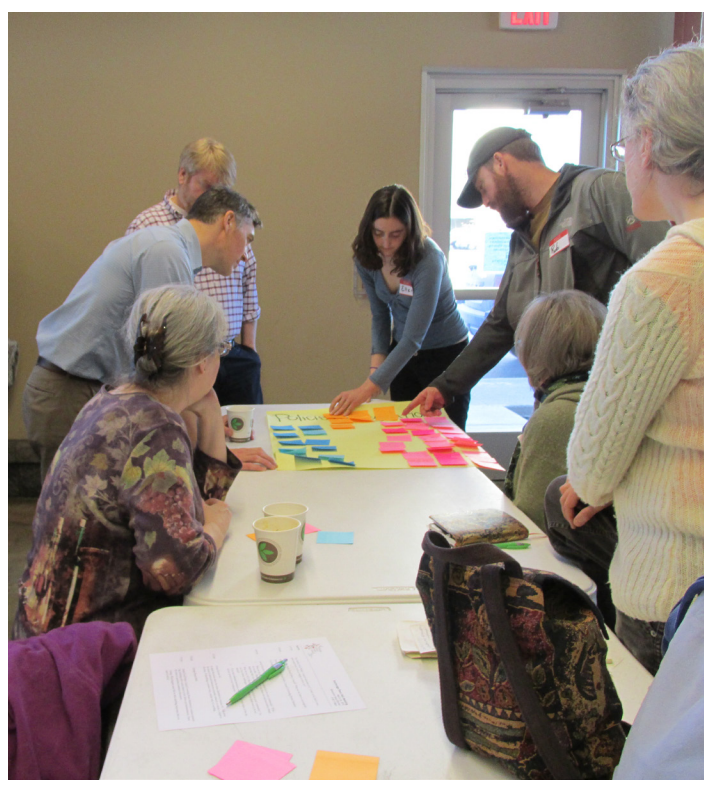
APPENDIX I - ALASKA FOOD POLICY COUNCIL - ANCHORAGE TOWN HALL MEETING - 9