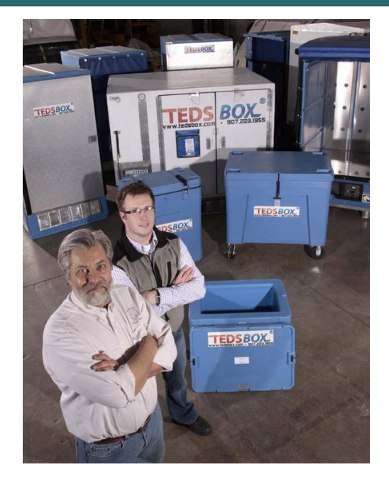
Insulated Delivery Boxes