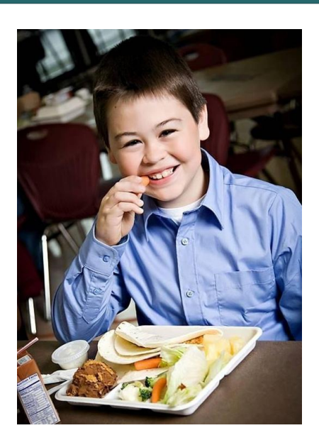
Fish to School Program in Kodiak