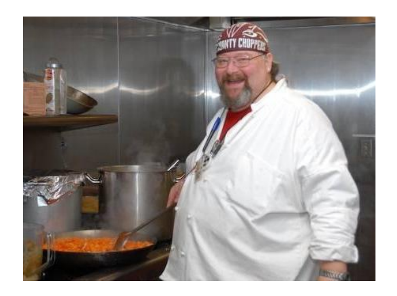
School chef in Nenana