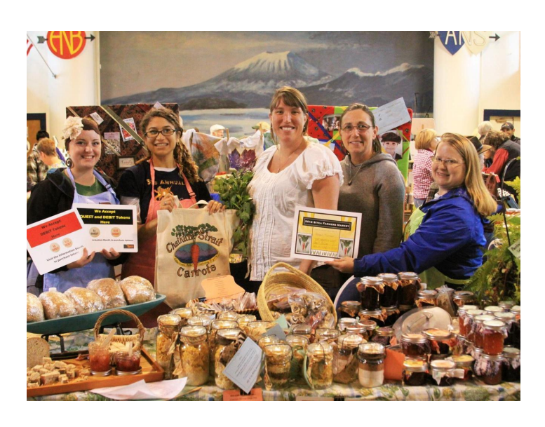
Vendors at Sitka Farmers Market