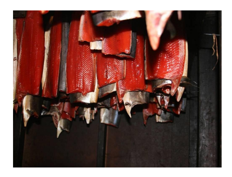
Salmon in Hydaburg Smokehouse