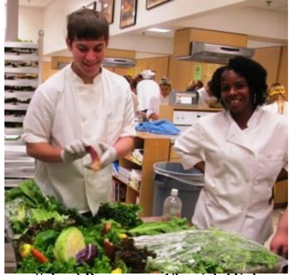
Farm to School Program at Chugiak High School