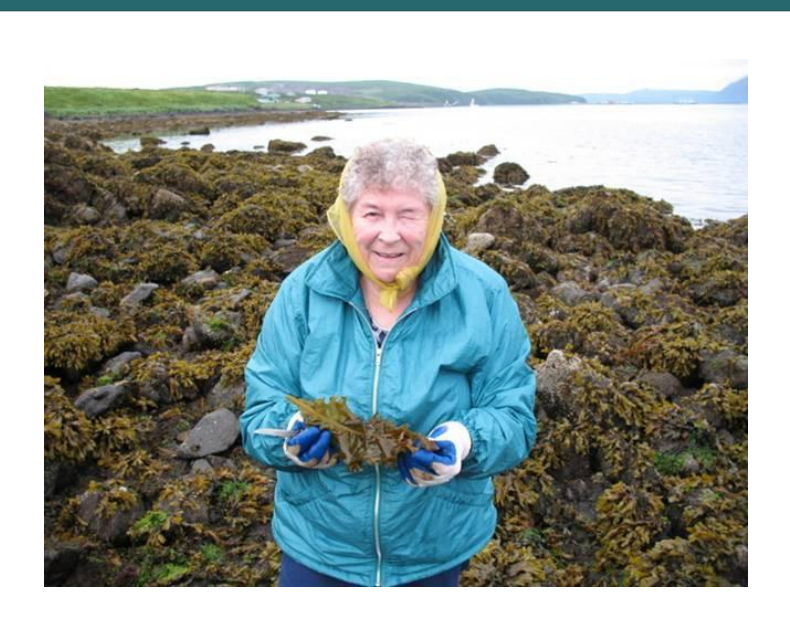
Gathering sea greens, Aleutian Islands