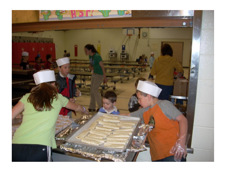
Serving burritos from Taco Loco