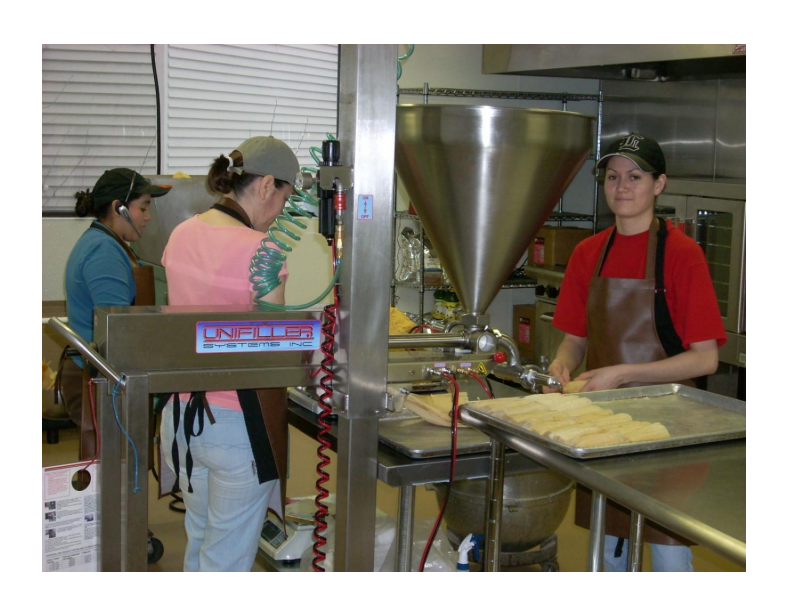
Making Salmon Wraps at Taco Loco, Anchorage