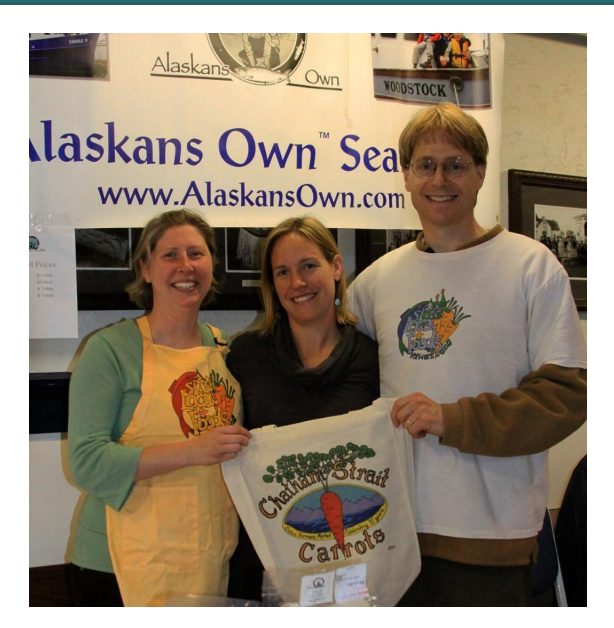
Sitka Farmers Market