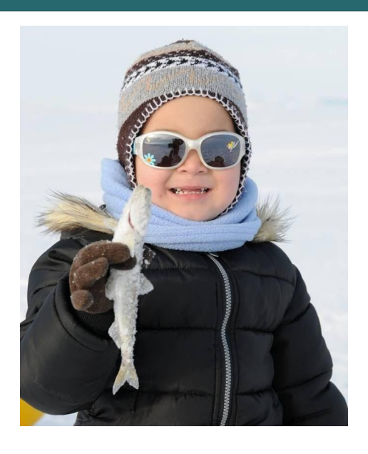
Ice fishing in Dillingham