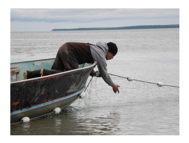
Adjusting a fishing net in Bristol Bay